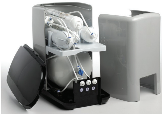
Fusion 2 360 Compact Cabinet RO systems provide easy access for cartridge changes and maintenance

Both models feature a built in Leak Stop interrupter, to protect your home from unintended leakage. Drinking water TDS may be easily checked by a push-button electronic monitor conveniently located on the front panel. Each of the Fusion 2 360 RO cabinets comes in stunning Platinum Ice trimmed in Midnight Black .